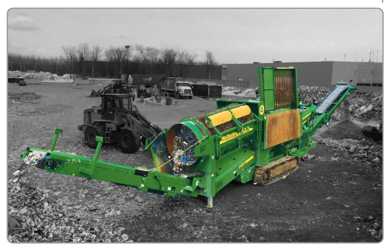
512RT shown with optional Tipping Grid & Spill Plate