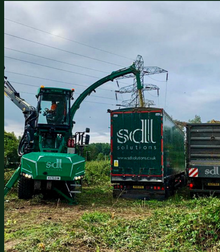
HGV WALKING FLOORS

Get in touch today for rates, further information, or if there's anything you're looking for that is not listed within this brochure.