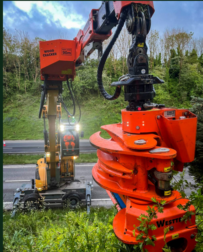
LIEBHERR & SHEAR

Get in touch today for rates, further information, or if there's anything you're looking for that is not listed within this brochure.