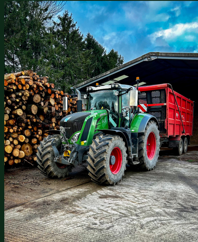
TRACTORS & TRAILERS