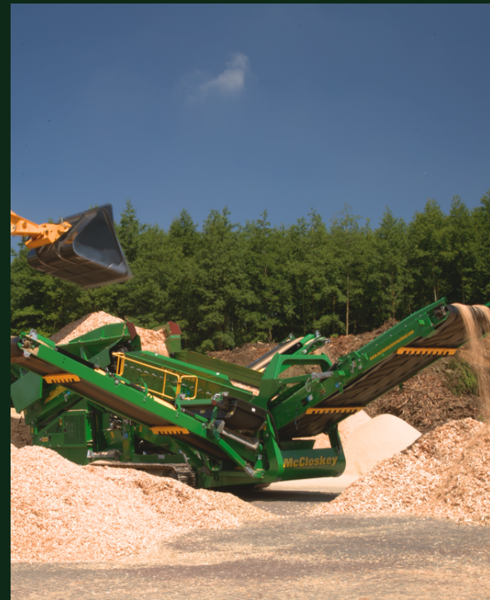
TROMMEL & 3-WAY SCREENERS