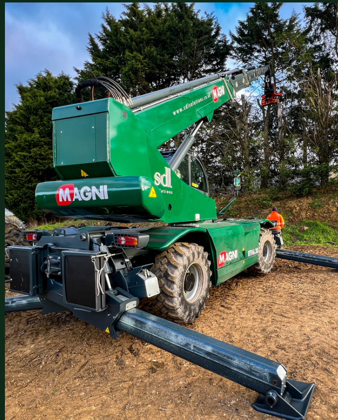
ROTO TELEHANDLER & SHEAR

Get in touch today for rates, further information, or if there's anything you're looking for that is not listed within this brochure.